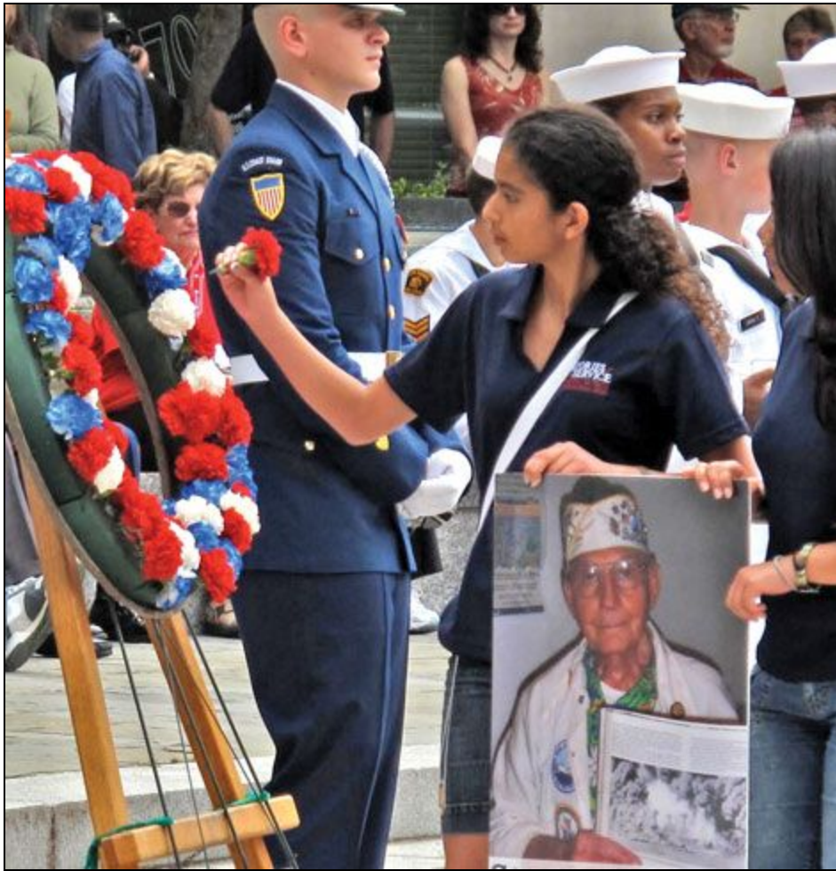
In a Navy wreath laying ceremony in San Diego, students honor a local Pearl Harbor survivor.